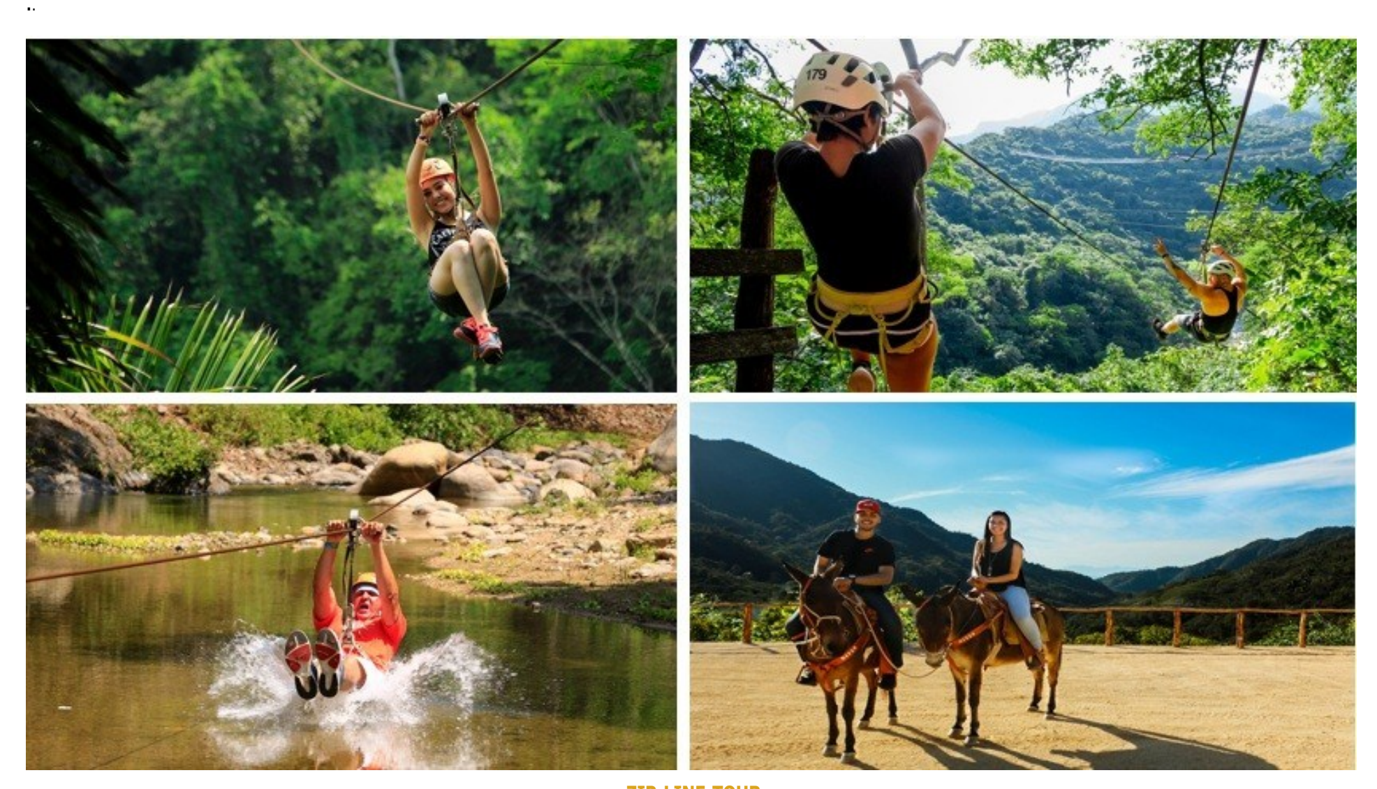
ZIP LINE TOUR

This no-holds-barred adventure begins with ziplining across mountains over the river, combined with hanging bridges, moving lines, and high-jumping action. We will fill up your senses with adrenaline while you rappel 88ft down and 78ft of free fall, where you will feel your heart beat to the maximum. You will have time to recover while our guides prepare your equipment to enjoy a refreshing and extreme zip line that ends up in the river. Just when you think there can be no more fun, where you will enjoy the wonderful landscape of the river, mountain and the trees, we will end up this adventure riding a mule, what do you think?