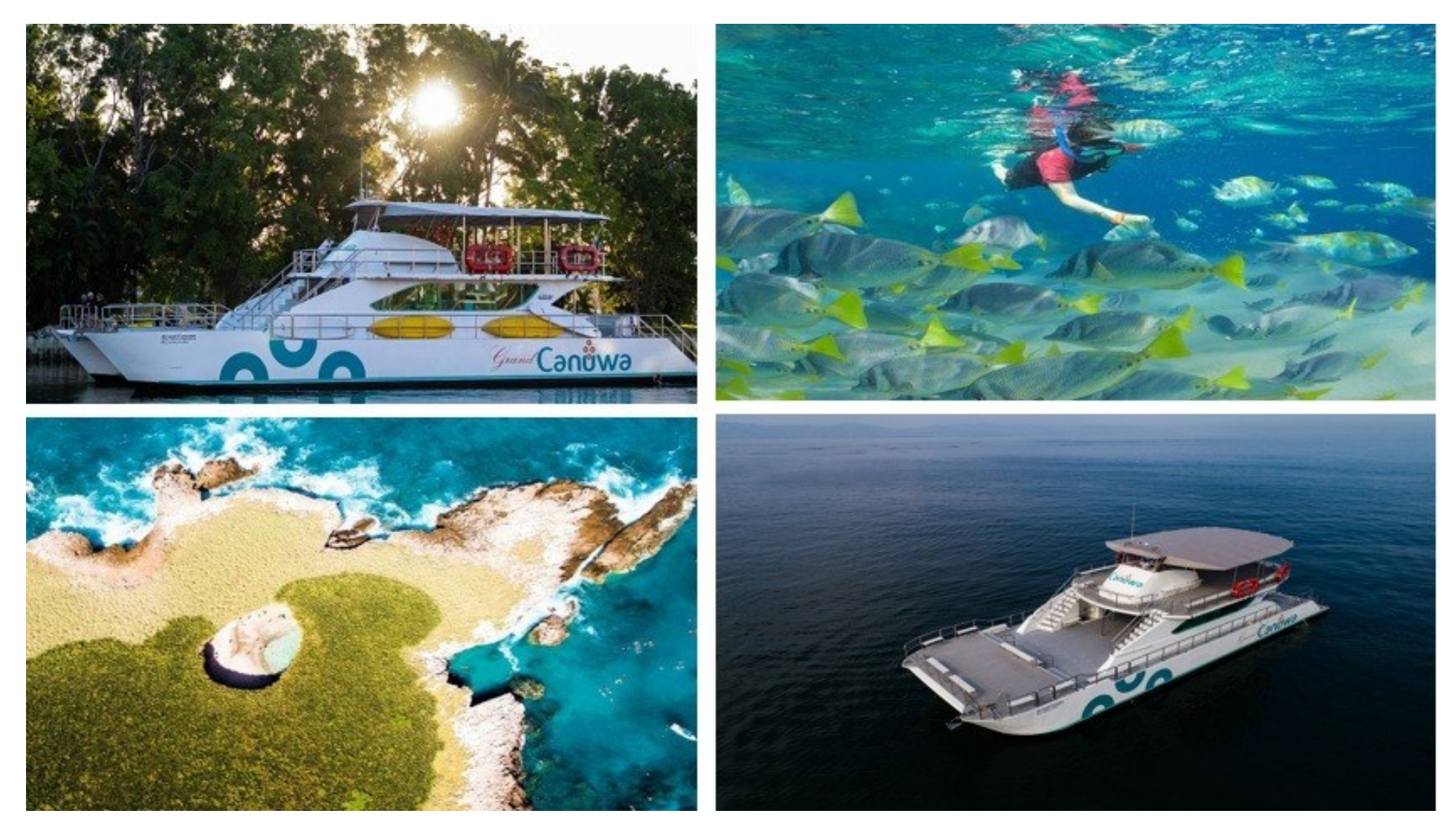
PRIVATE CATAMARAN TO MARIETAS AND SNORKEL

This incredible excursion will create the perfect opportunity for guests to experience the wonders of our unique Bahia de Banderas, our ocean, nature and fishing colonies.