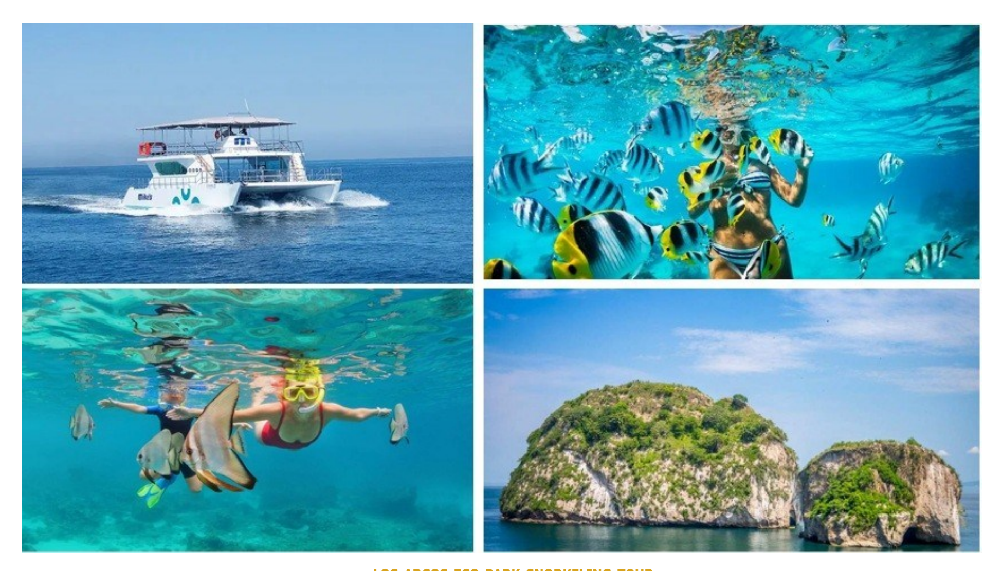
LOS ARCOS ECO PARK SNORKELING TOUR

These incredible excursions will give you the opportunity to experience infinite wonders of the ocean, nature and fishing colonies. While our vessel navigates south of the bay, we will enjoy the view of the town and its outstanding and unique Mexican architecture.