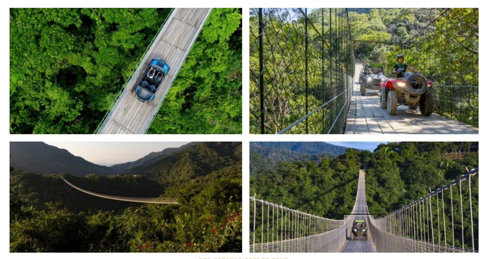
RZR JORULLO BRIDGE TOUR

Earth, water, air, and adrenaline ... The perfect combination for a great adventure!