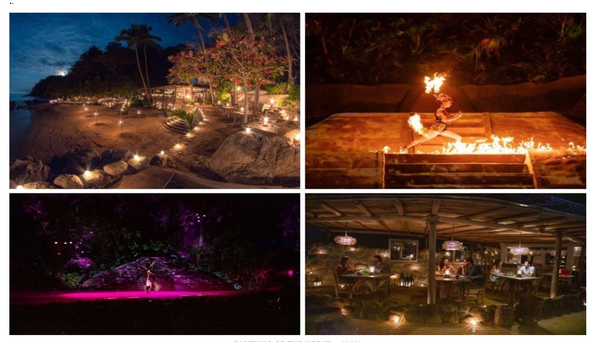
RHYTHMS OF THE NIGHT - ALMA

ALMA by Rhythms of the Night is truly a feast for the senses which celebrates our spiritual connection to the animals and nature. Your night begins with a sunset cruise (with an open bar) that will take you to Las Caletas, a beach only accessible by boat. Your night will include a romantic, delicious buffet candle-lit dinner in one of our hillside open dining rooms and terraces. At show time, you'll be seated in our open-air amphitheater to experience the immersive story of Alma through a mixture of acrobatics, original music, and special effects. Alma by Rhythms of the Night is the best way to experience the magic of Puerto Vallarta.